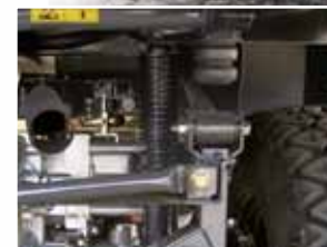
Robust, reliable semi-independent rear suspension