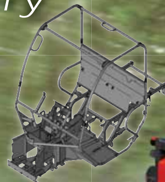
Standard Rollover Protective Structure (ROPS)

Featuring a robust, heavy-duty platform, electronic fuel injection (EFI) and an advanced Continuously Variable Transmission with inertial clutch (CVT Plus) for excellent response and reliability, the new 4WD RTV400Ci will be at your ready, whether you're canvassing your property or jobsite, caring for livestock, or hunting in the woods.