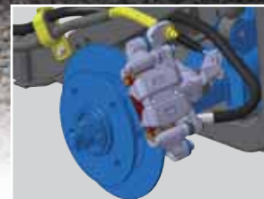
4-wheel disc brakes